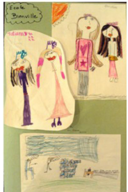
Children's drawings that staff at Bienville School sent on to us

People with an intellectual disability: 123